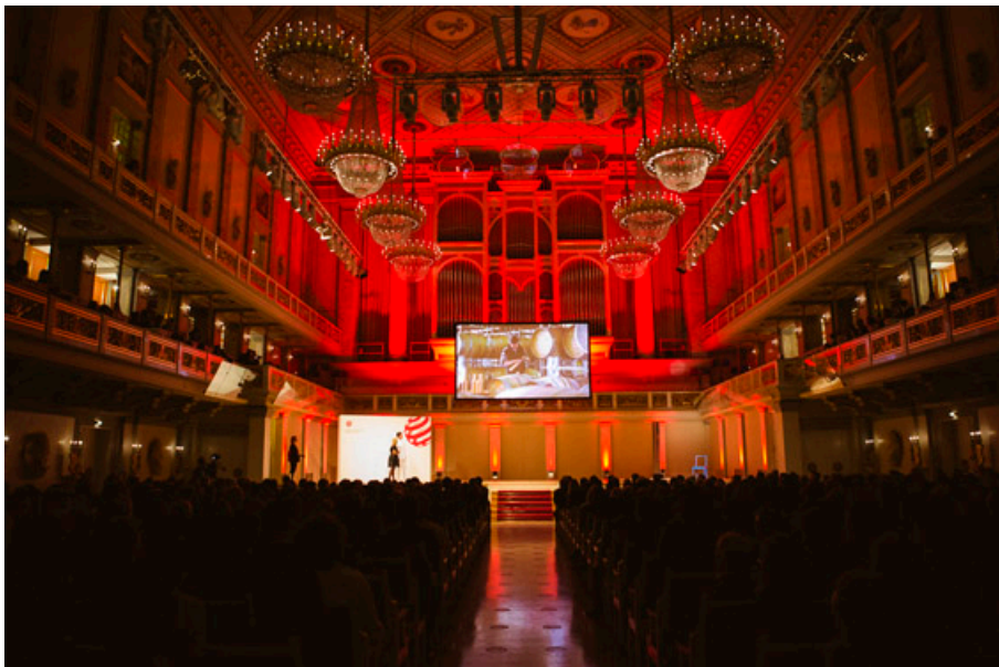
Picture 2: At the official Red Dot Gala at “Konzerthaus” in Berlin Mitsubishi Electric was honored with the coveted award “Best of the Best” and “Grand Prix 2016” for its interactive robot application